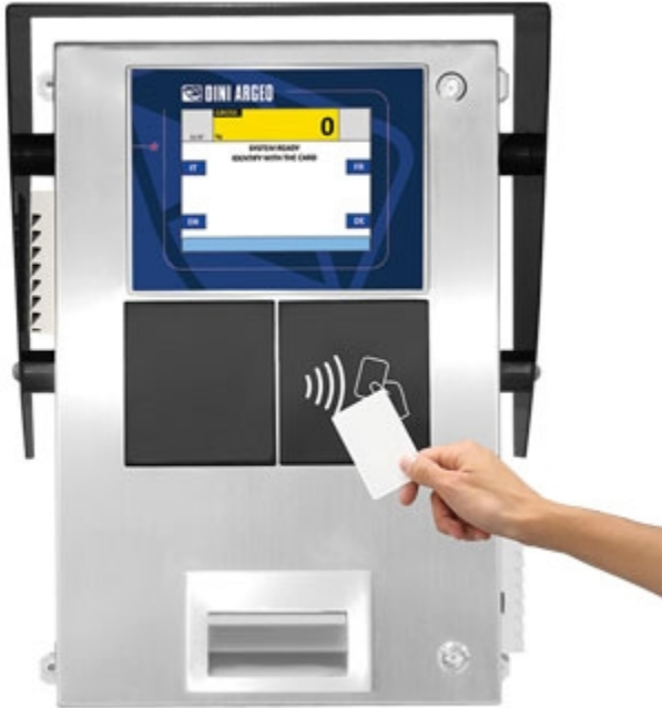
3590EGTBOX8: with RFID card reader.